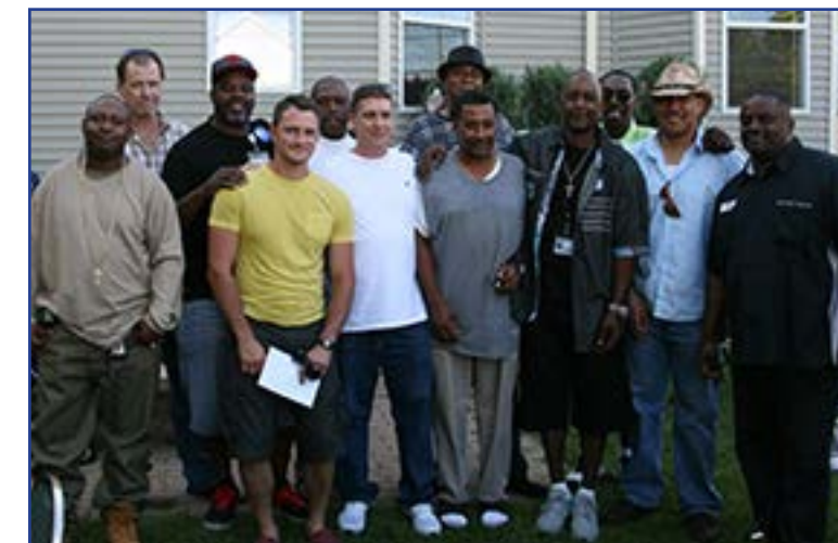
Graduates attended the September cookout