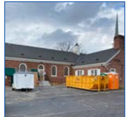
Dumpsters & trucks have arrived!