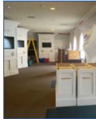
Moving the Welcome kiosks