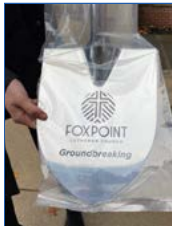
It's official, ground has been broken!