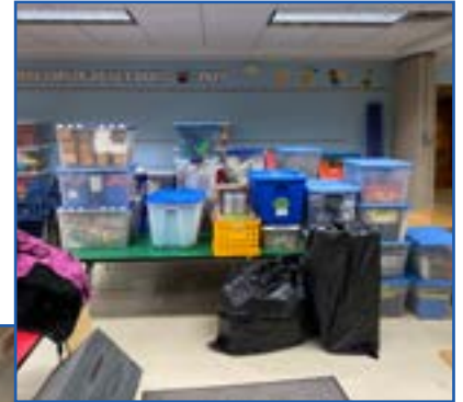
Packing up Sunday School

Meanwhile, we're finding new ways for worship and fellowship. If this email was forwarded to you but you would like to receive weekly email updates with ways to connect, click HERE . You can also watch our project progress on Facebook and Instagram.