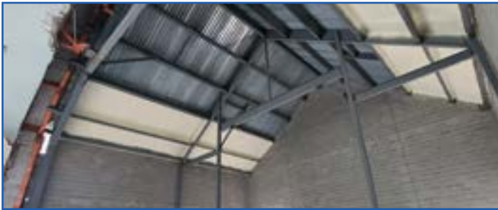
A glance at the new sanctuary area's lofty ceiling

Cornerstone Plumbing worked on new roof drains and overflow piping on the two lower roof sections. Roofers will begin this week.