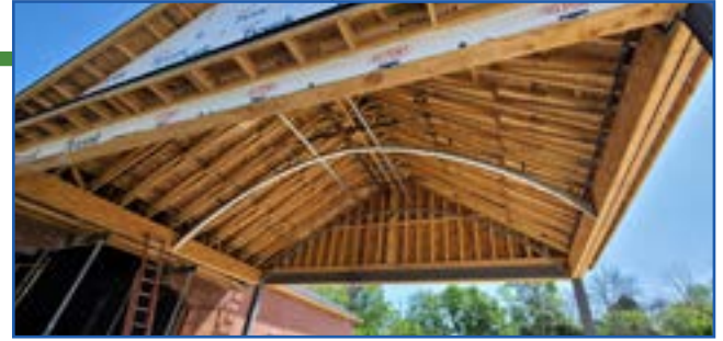
The metal stud framing for the barreled ceiling of the porte cochere has just begun

Crown Carpentry increased their crew size and have been busy all around the project, but they focused on layout/framing of the new walls and ceilings in the area of the new main entrance.