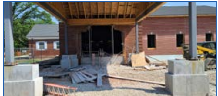
This is normally a busy new opening at the site, with people busy framing, hammering, cutting, welding... you name it!

I.T. Connect worked within the church to finalize network design elements. They created a final design for all hardware components and a plan that can be shared with the construction team.