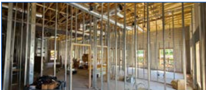
Metal studs installed for the office walls in the admin area

Northern Concrete set and poured the concrete topping in the sanctuary addition. This topping creates the level surface over the precast plank. It is the final concrete floor of the sanctuary and will later carry the raised stage floor of the chancel.