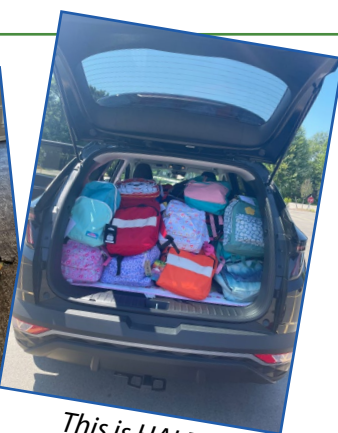
This is HALF of the backpacks!