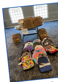
Backpacks ready for filling

Coats will be sorted and given to our partner churches as well as other organizations in Milwaukee.