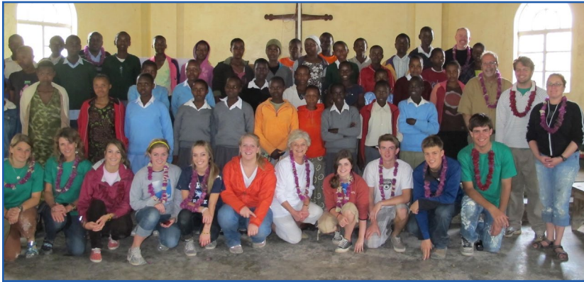
One of our trips to Tanzania, this one with FPLC youth.