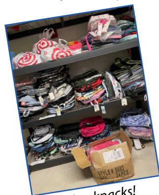
120 + backpacks!

All Peoples has families sign up to receive the bags. Their numbers were up this year! They gave out over 300 backpacks with school supplies, which is a new record. Kids in their congregation and kids in the area served by All Peoples all benefited.