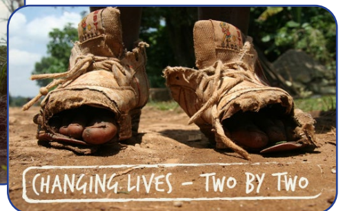
CHANGING LIVES - Two BY Two