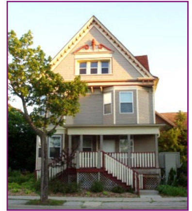
Serenity Inns: 2825 W. Brown St., Mke

Volunteers make dinner and take it warm to the Inn by 5:45 pm (for a 6 pm start time). The men meet you at your car to carry items inside. Prepare the meal in your cookware (vs buying aluminum pans) if you like because the men will wash it and carry it to the car at the end of the meal. As the number of residents varies, you'll receive an email a week before your date with the number of residents; right now the number is between 9 and 12. You'll be cooking for yourselves, the men and the innkeeper. You're usually on your way home by 7 pm. Two families, friends, small group members etc. are welcome to volunteer together to share the meal prep and dining experience.