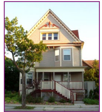
Serenity Inns: 2825 W. Brown St., Mke