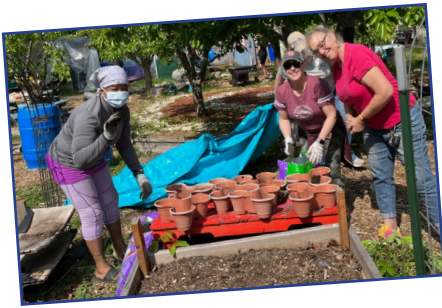
planting seedlings in warm row tunnels.

It's that time of year when there's so many garden jobs to get done, but honestly, the garden needs volunteers all season long! If some of these dates work for you, that's great, but if not or you're looking for more, you can schedule another time to work in the garden either as a group or individual/family.