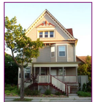
Serenity Inns: 2825 W. Brown St., Mke