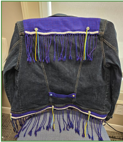
One of our many auction items.