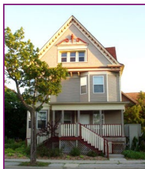
Serenity Inns: 2825 W. Brown St.