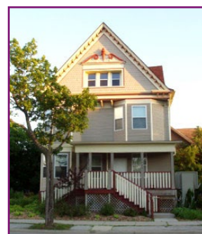
Serenity Inns: 2825 W. Brown St.