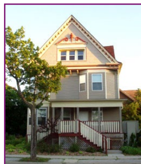
Serenity Inns: 2825 W. Brown St.