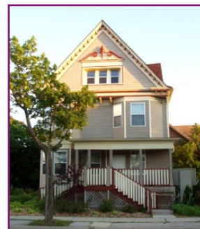
Serenity Inns: 2825 W. Brown St.