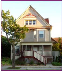
Serenity Inns: 2825 W. Brown St.